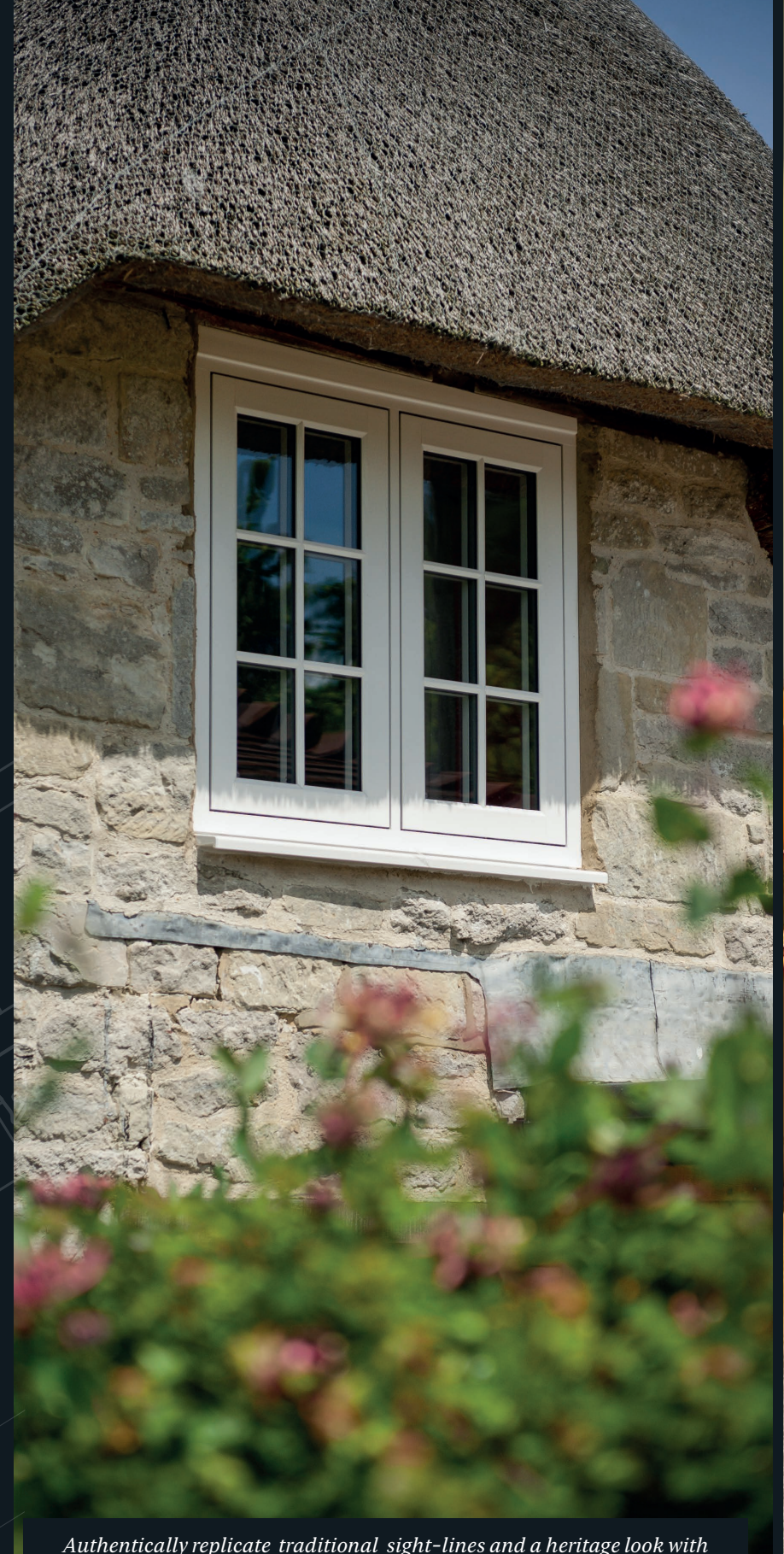
Authentically replicate traditional sight-lines and a heritage look with Georgian bar - no comprise on function or aesthetics.

For most homeowners, the style of their property will inform the design choices they make, so if you live in a Conservation Area Residence 9 can help enhance both appearance and performance, we have proven experience in helping to restore the original character of properties in hundreds of Conservation Areas, always with an eye to any planning considerations. We have also been approved in a number of Grade II Listed properties. If you are in a location with more design freedom R9 can help bring your ideas to life, balancing design and practicality to enhance your home, whilst still maintaining traditional looks.