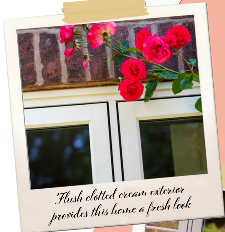
Flush clotted cream exterior provides this home a fresh look