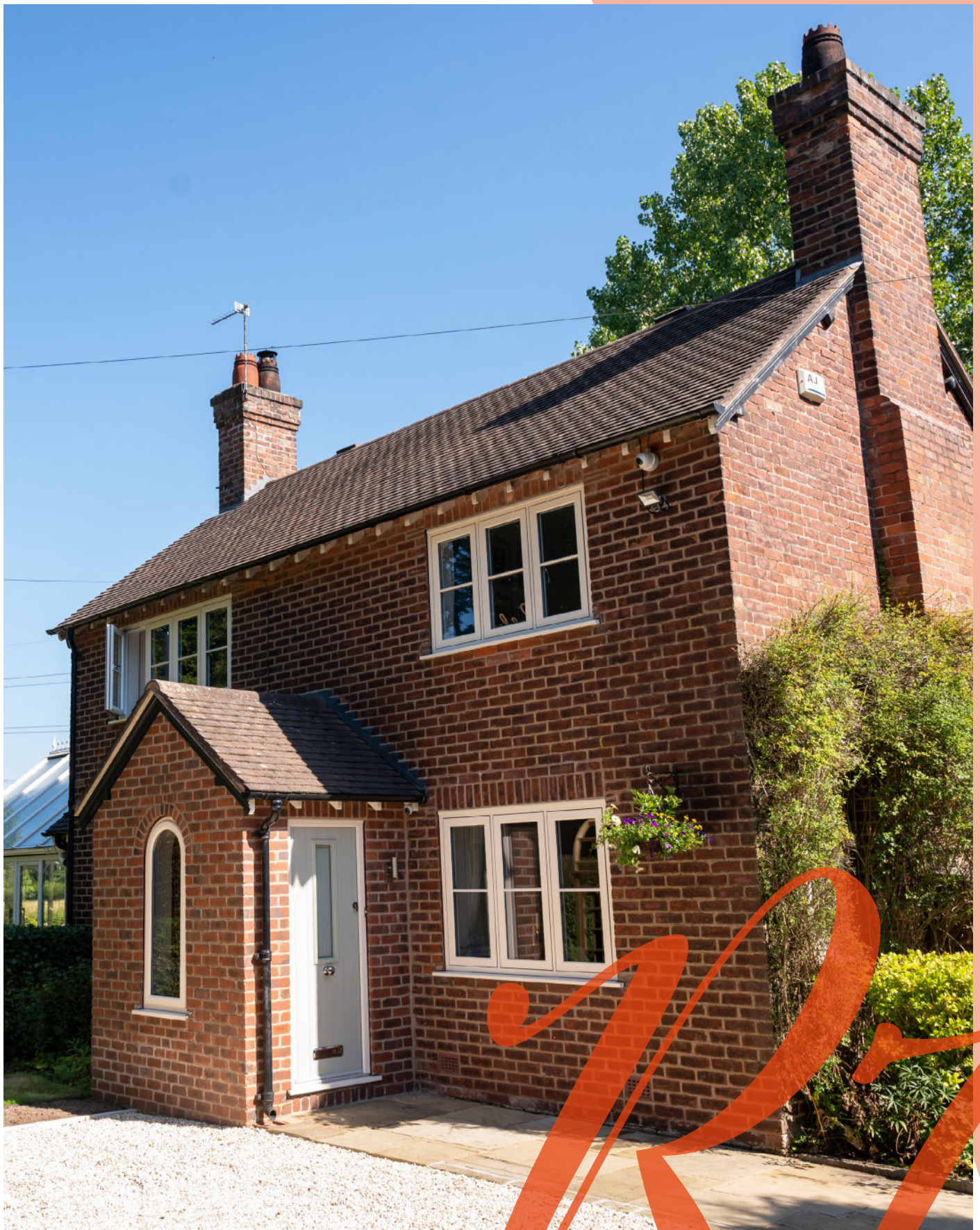
RESIDENCE 7 WINDOWS | CLOTTED CREAM ● CHALK WHITE