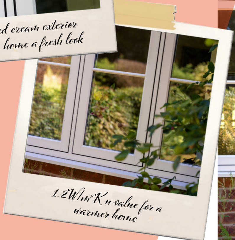
1.2W/m²K u-value for a warmer home