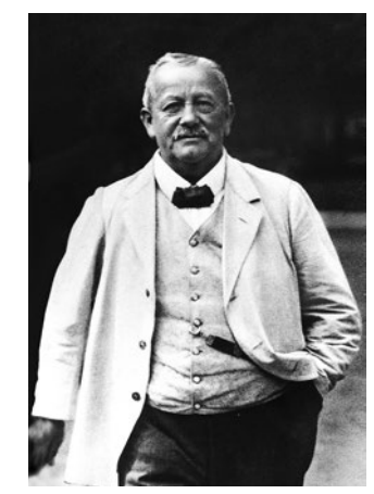
Company founder Karl Kömmerling

Decades of know-how are incorporated in the window system production operations and we soon evolved into a leading systems supplier. The latest system generation of KÖMMERLING 70 with chamfered or ovolo detailing sets unique standards of performance in a PVCu window. It incorporates our comprehensive expertise, decades of research and development work, state-of-the-art CAD and 3D computer modelling and countless tests. This revolutionary window system reflects our commitment to offering best-in-breed products for our customers.